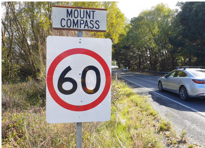
60km/h speed limit in Mount Compass.