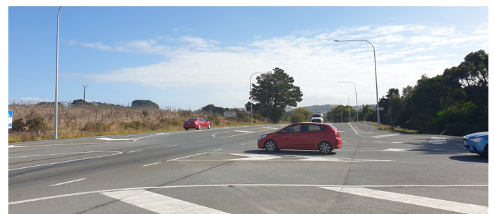
Goolwa Road intersection, looking north.