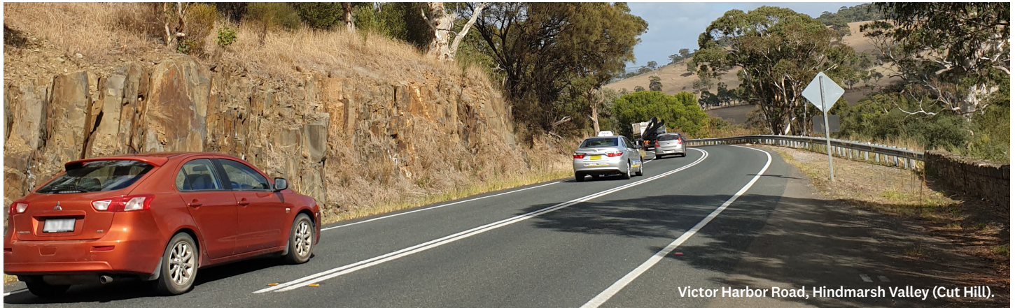
Victor Harbor Road, Hindmarsh Valley (Cut Hill).