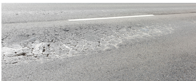
Fatigue cracking and rutting between McLaren Vale and Willunga.