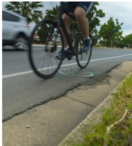
Narrow, uneven cycle lane on ANZAC Hwy

2,544 cyclists were injured (2,518) or killed (26) in a road crash between 2015 and 2019