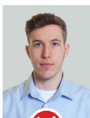
Too far away